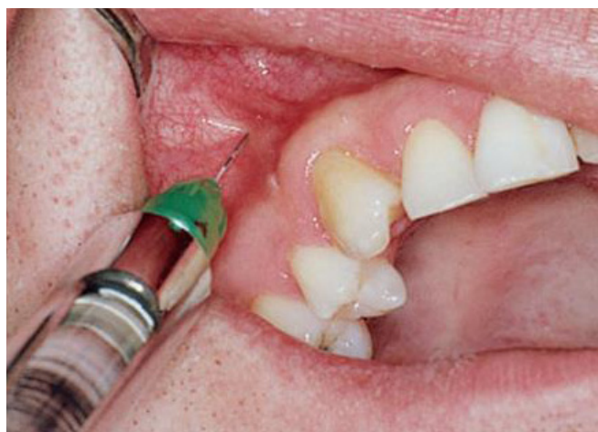
Fig.2 A maxillary buccal infiltration

The study concluded that articaine provides a significant advantage over lidocaine in patients with symptomatic irreversible pulpitis who had endodontic treatment for supplementary infiltration after mandibular block anesthesia but no advantage over lidocaine when used for mandibular block anesthesia alone or for maxillary infiltration.