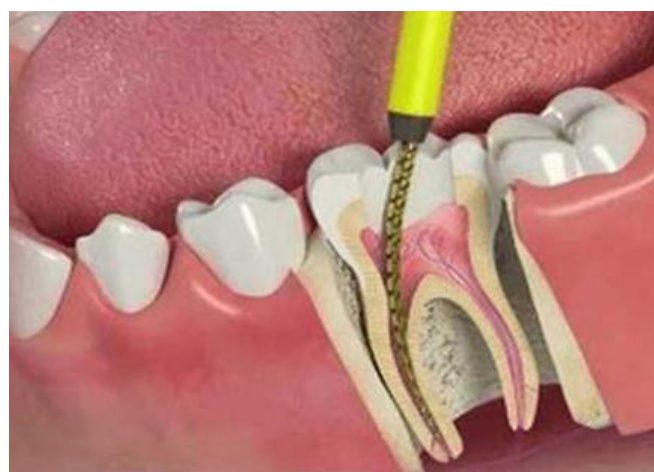
Fig.3 Root canal treatment

Therefore, the pain after RCT in the articaine group was significantly less than the lidocaine group, concluding that using articaine for IANB may increase post-RCT comfort better than lidocaine.