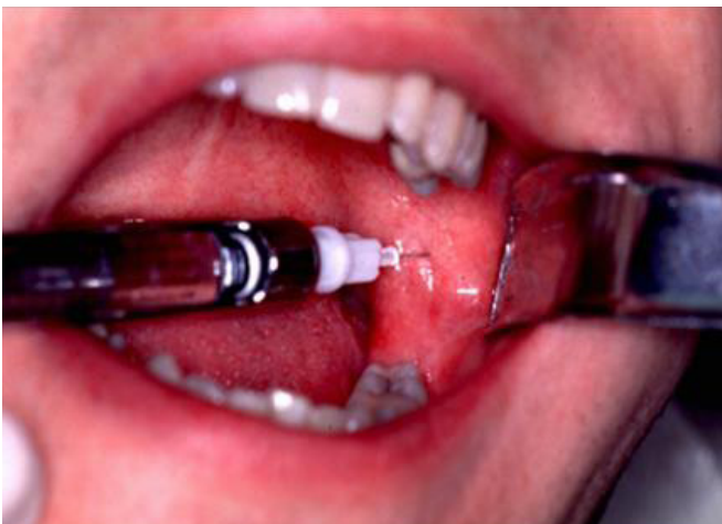
Fig.4 Inferior alveolar nerve block

The conclusion is that single anesthesia techniques (IANB or BI) were not able to achieve pain-free emergency endodontic treatment with both articaine 4% BI and lidocaine 2% IANB in an emergency RCT in patients with symptomatic irreversible pulpitis in mandibular molars. To increase the success rate supplemental anaesthetic techniques should be considered prior this specific treatment procedure.