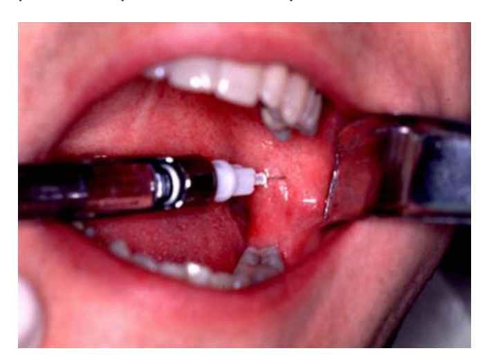
Fig.4 Inferior alveolar nerve block

The conclusion is that single anesthesia techniques (IANB or BI) were not able to achieve pain-free emergency endodontic treatment with both articaine 4% BI and lidocaine 2% IANB in an emergency RCT in patients with symptomatic irreversible pulpitis in mandibular molars. To increase the success rate supplemental anaesthetic techniques should be considered prior this specific treatment procedure.