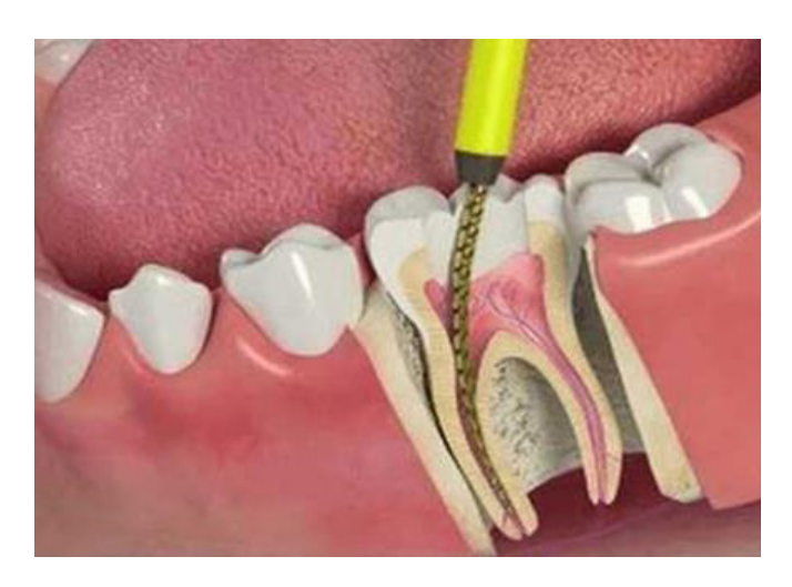
Fig.3 Root canal treatment

Therefore, the pain after RCT in the articaine group was significantly less than the lidocaine group, concluding that using articaine for IANB may increase post-RCT comfort better than lidocaine.